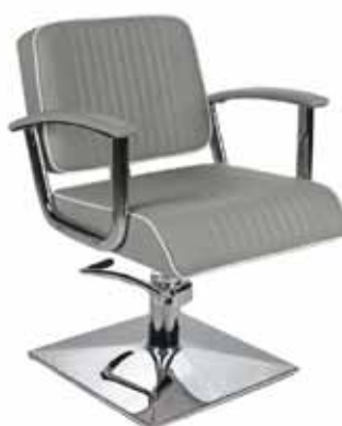
Madison Styling Chair