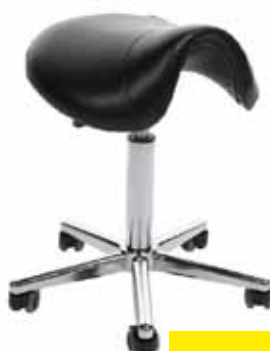
Devon Saddle Stool