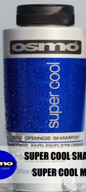
SUPER COOL SHAMPOO SUPER COOL MASK