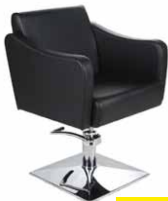
Manhattan Styling Chair