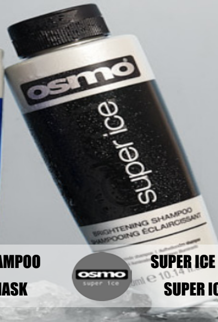
SUPER ICE SHAMPOO SUPER ICE MASK