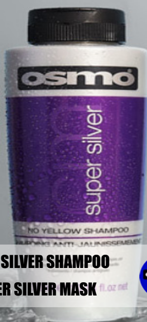
SUPER SILVER SHAMPOO SUPER SILVER MASK