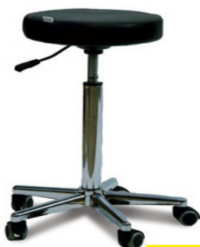
Devon Round Stool